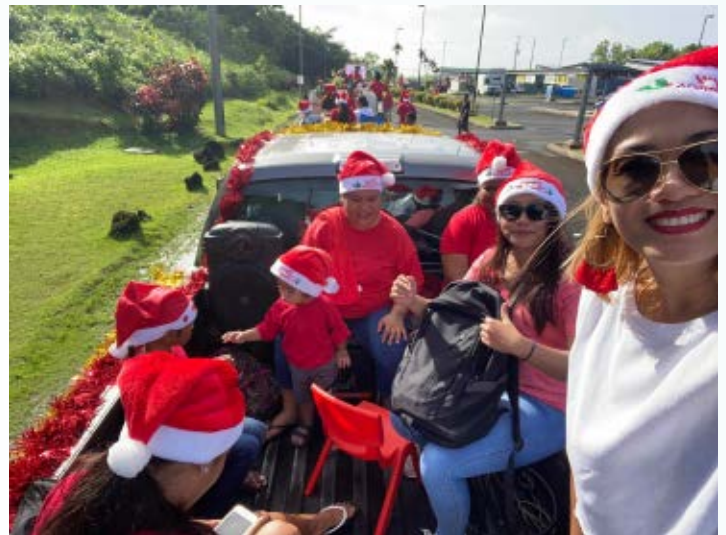
Neco Plaza participated in the annual CM Parade and brought candy to the children of Palau.