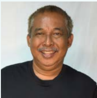
Joselito A. Hernandez Motors Saipan Service