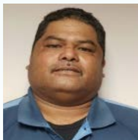
Mismark Siren Five Star Wholesale