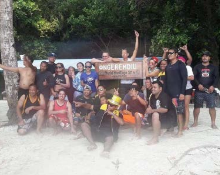
CM Party January 1, 2020 in the islands.