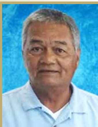
Vicente Lizama Motors