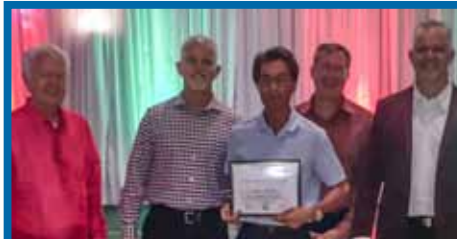
Agapito Salalila Service HQ