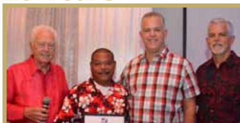
Leo Bobai Motors